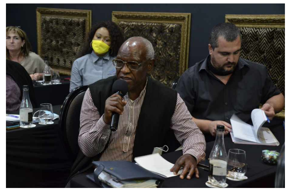
Estate Agents voiced out their challenges during the Rental Housing Public Consultation Session at Fusion Boutique Hotel