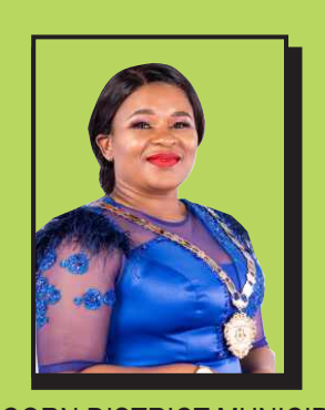
CAPRICORN DISTRICT MUNICIPALITY EXECUTIVE MAYOR: CLLR. MAMEDUPI TEFFO