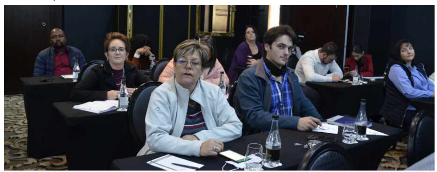
Rental Housing stakeholders attending the Rental Housing Public Consultation Session at Fusion Boutique Hotel.